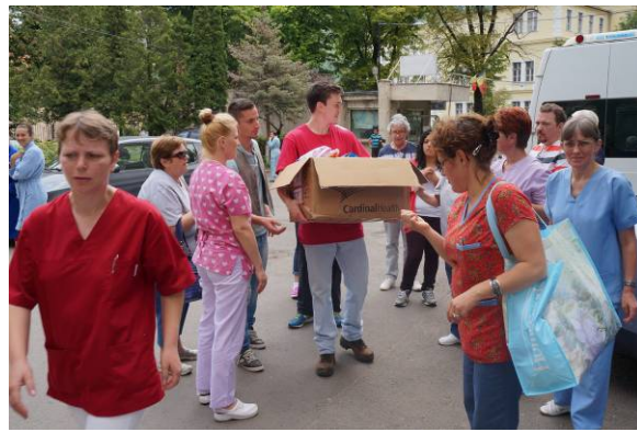
Maternity Hospital donations of medical supplies