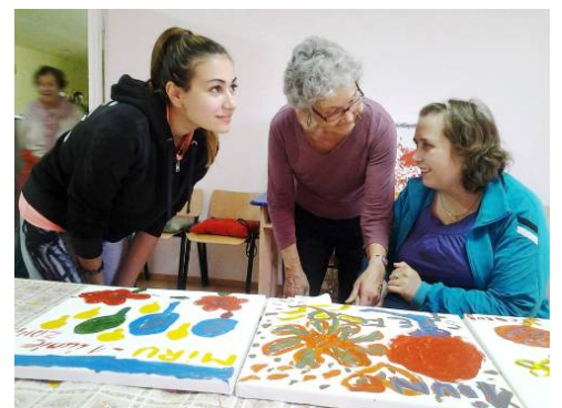
An amazing place – Brasov School for the Blind. Beautiful artwork created by the children/teens.